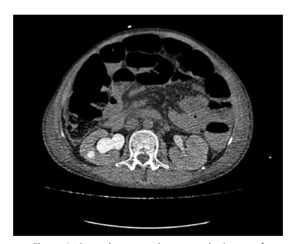
Figure 3. Second computed tomography image of bilateral renal pelvic grade 2–3 hydronephrosis

135/70). Additionally, intra-abdominal pressure measurements were taken in order to differentiate between abdominal distention and a possible case of abdominal compartment syndrome. Sterile isotonic was administered to the emptied bladder with a branule inserted on a Foley catheter, but failed due to high pressure. The process was repeated several times, but failed in each instance. In order to check for a hematoma, an unenhanced computed tomography (CT) scan was performed on the patient with low hct, severe progression on physical examination and stable vital signs. During the tomography, an enlarged hematoma (type III RSH) was detected that filled the bilateral lower quadrants, compressing the bladder and causing grade 2–3 hydronephrosis in both kidneys (Figures 2-3).